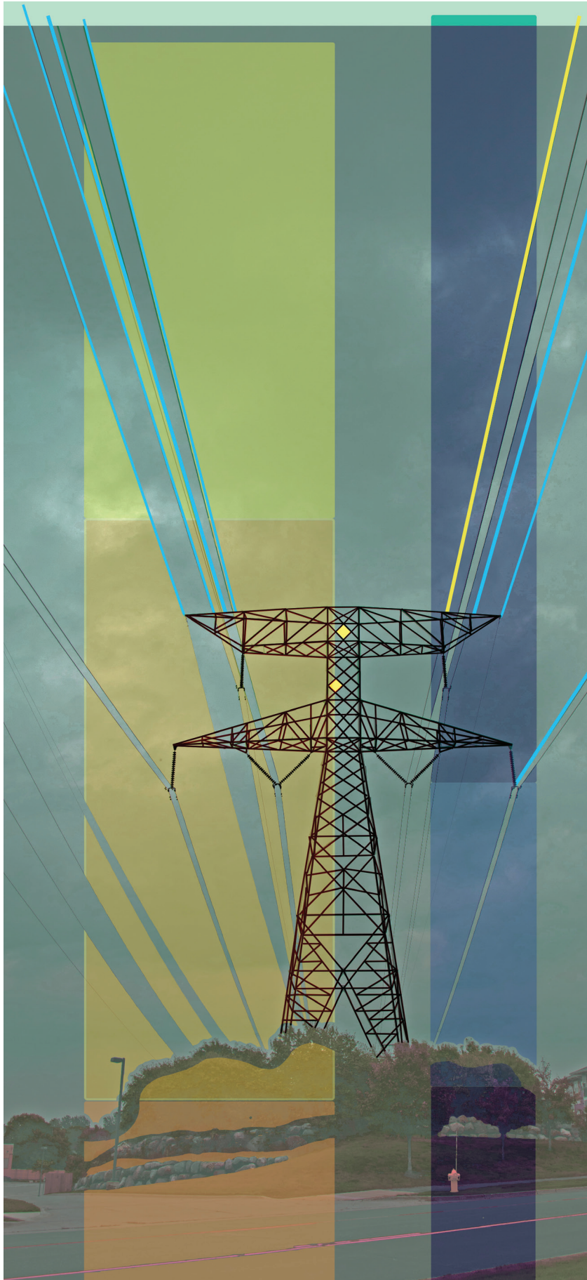
Power 2020, inkjet print Gretchen Funk