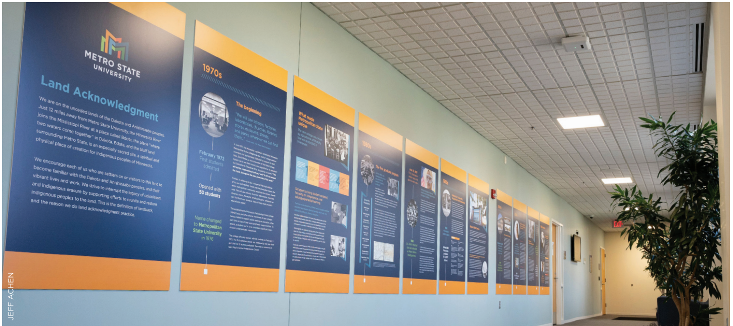
Timeline in St. John's Hall